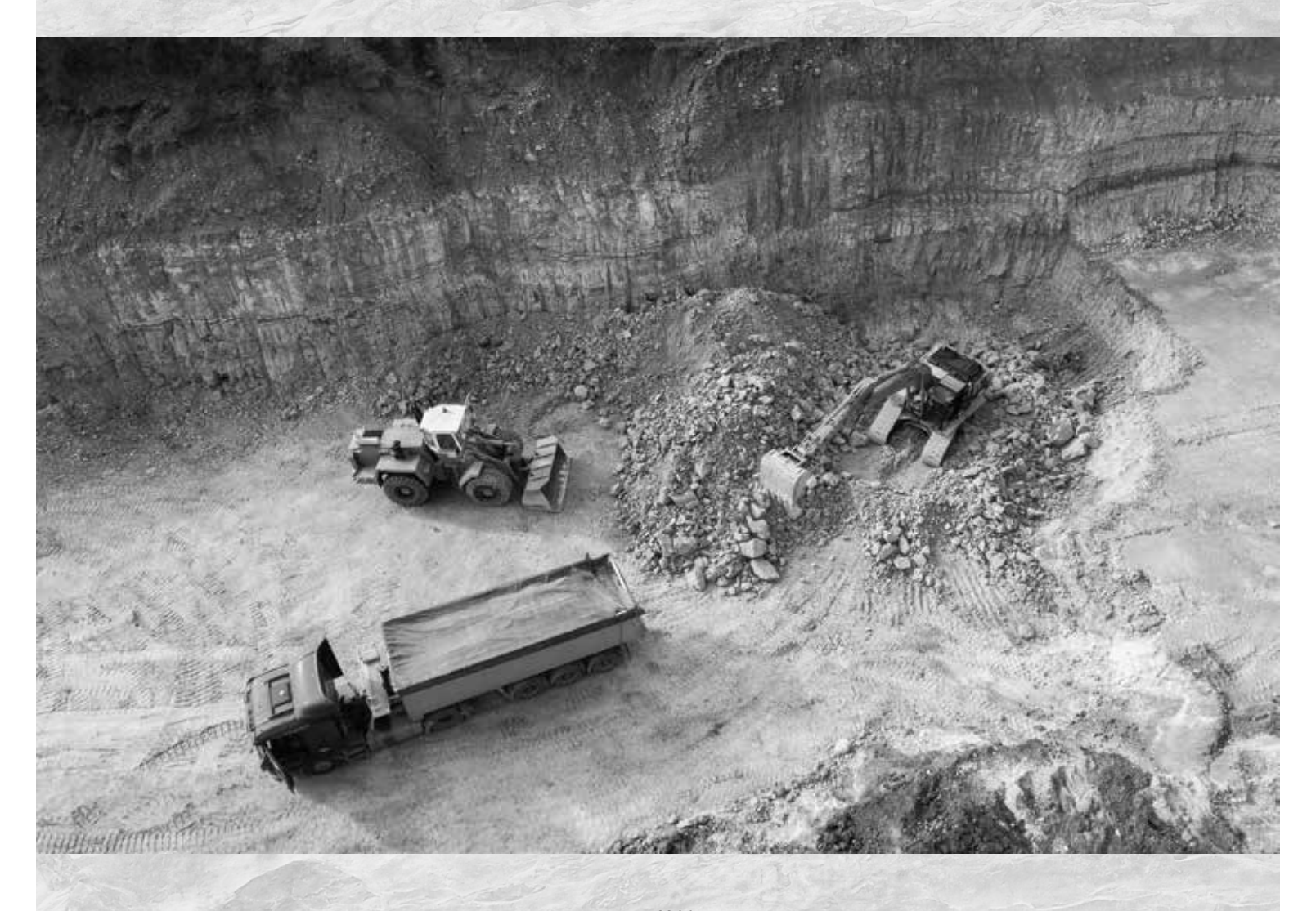
Zug 6300 Switzerland